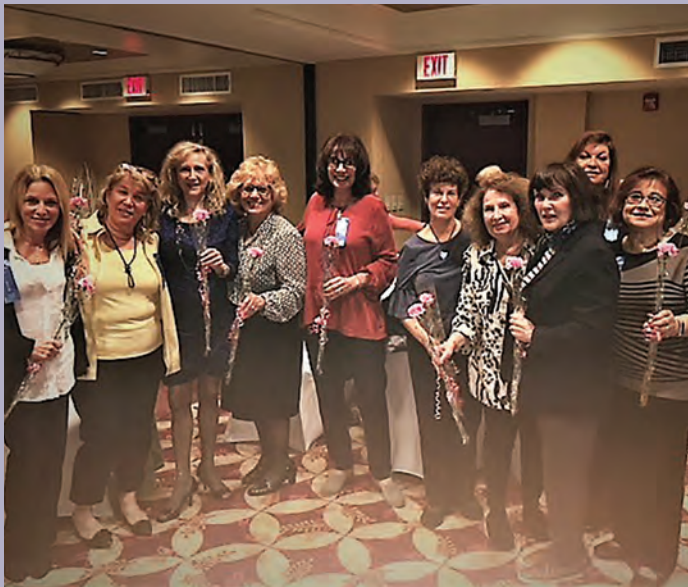
LONG ISLAND, NY—The Shalom Club of the Long Island Council celebrated its 36th anniversary at the council's annual membership luncheon.