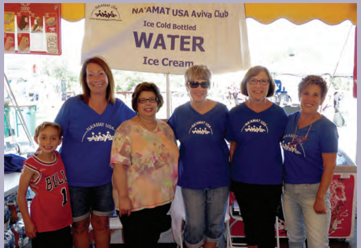
BUFFALO GROVE, IL—The Chicago Council's Aviva Club earned more than $4,000 selling water and ice cream during Buffalo Grove Days over Labor Day weekend.