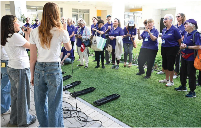
WZO participants visit Kanot Youth Village (above, at right) in October.