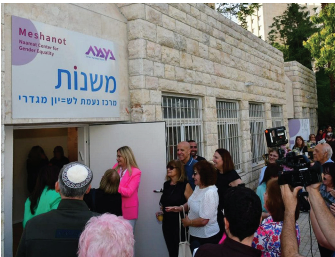
Meshanot, the NA'AMAT Center for Gender Equality, opened on April 26, 2022. The center tells the story of the NA'AMAT movement's struggle for equality.