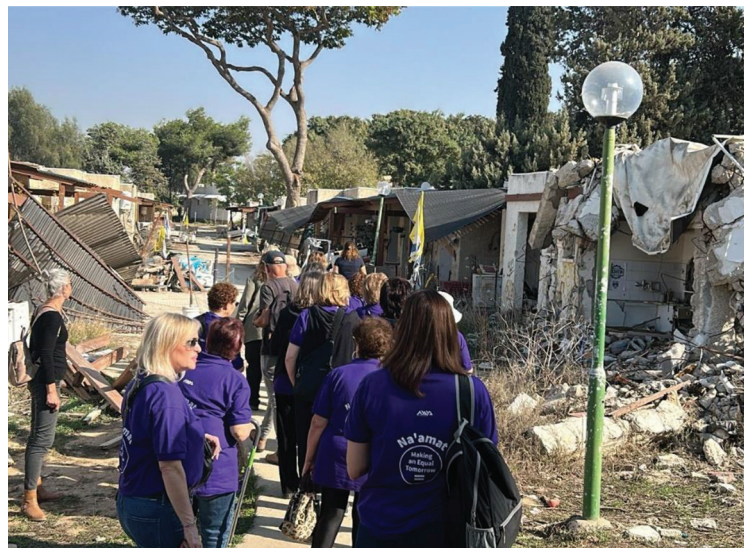
U.S. and Canadian members tour Sderot (above) and Jerusalem (below) in December as part of their leadership seminar.

In December a group of leaders from the U.S. and Canada toured the south of Israel and Jerusalem. In addition to visiting the sites of the Sderot police station and the Nova festival, they were inspired by their visits to the Ze'elon Daycare Center in Sderot, and the Old City, Temple Mount, the Western Wall and Meshanot in Jerusalem.