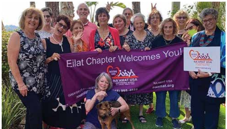
NA'AMAT chapters around the country, such as Eilat in Greater Los Angeles, organized watch parties to view the convention.

After co-chair Susan Isaacs closed the convention with "See you in Jerusalem," the ubiquitous Academy Award tune "Hooray for Hollywood" played in the background as images of the famed Hollywood sign, the Farmers Market and Universal Studios popped up on the screen. Hooray for NA'AMAT!